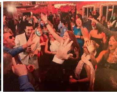
Dance and Disco