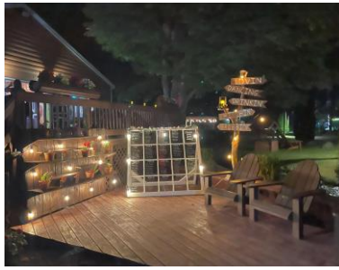
Windowpane table placements