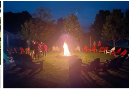
Campfire wine & beer