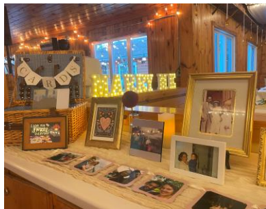
Great Family photo station