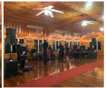
10 Piece Live Band