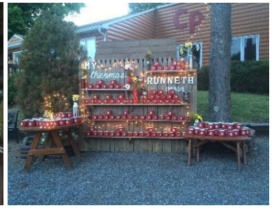
Gift station with mugs