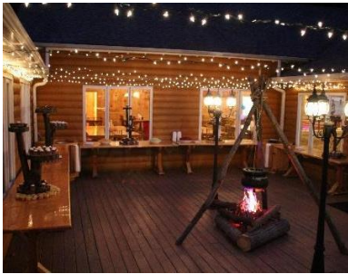
Outdoor Dessert Bar