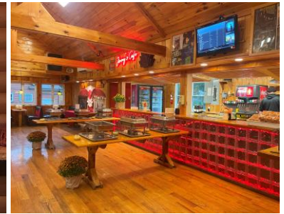
Self-serve sports bar