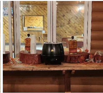
Hot Spiked Cider Station