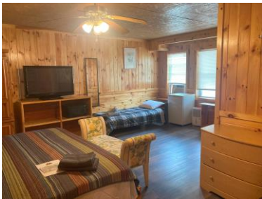
2 of the 40 available Private rooms

Our staff will meet your guests in the parking lot and direct them or are shown to the rooms as needed. Golf carts that are to be driven only by our staff are available to help with their luggage throughout the weekend.