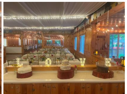
Selection of log cake stands