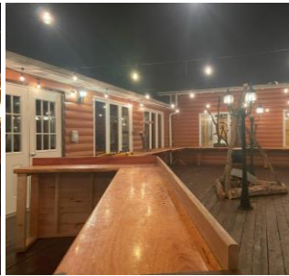
Outdoor Deck Bar