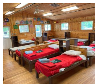
Cabin / Bunk