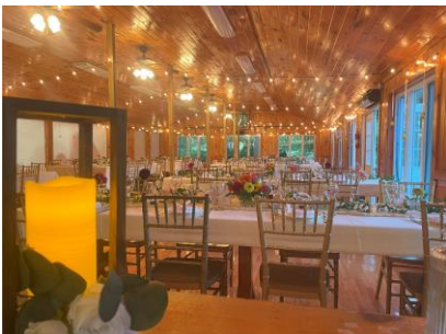
Tables, lights, and decorations