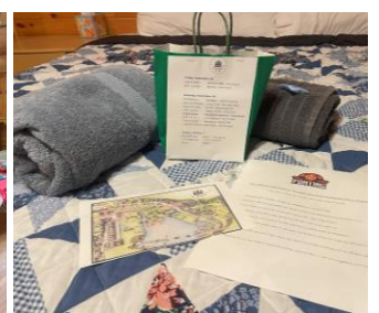
Map, Rules & Gift Bag